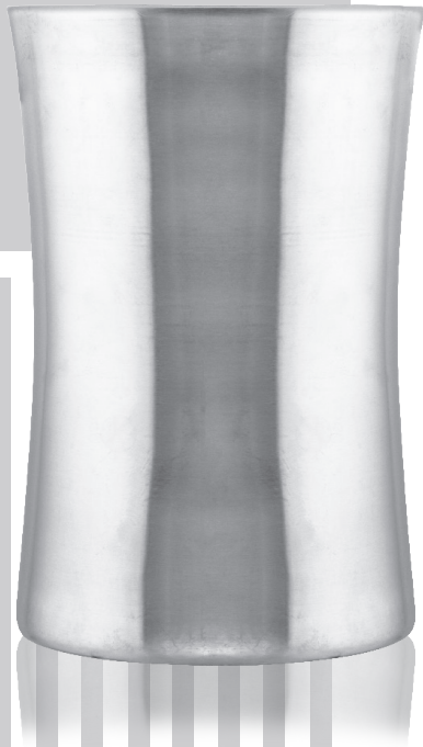
Stainless Steel Chiller

A wine accessory is generally any equipment that may be used in the serving of wine. Wine accessories include many items such as corkscrews, bottle stoppers, aerators and wine chillers.