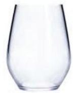
Stemless White N0424 16.75 oz.