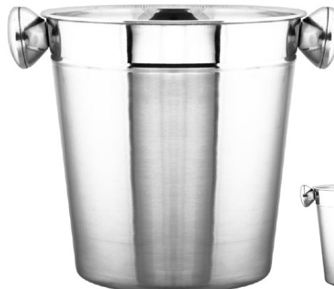
Stainless Steel Ice Bucket