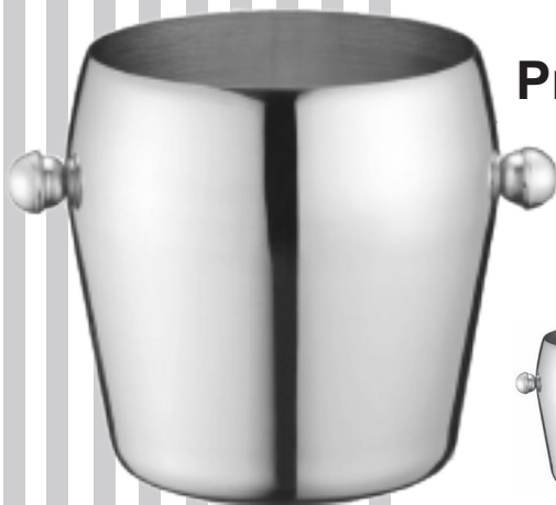
Premium Ice Bucket