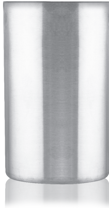
Stainless Steel Chiller